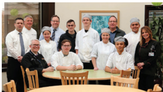
Former students of the MCVSD student externship program with Food and Nutrition Services staff and MCVSD leaders.